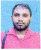
PRESIDENT GREEN LEAF FOUNDATION, GOSSAIGAON

Dear Friends, Supporters, and Well-Wishers,